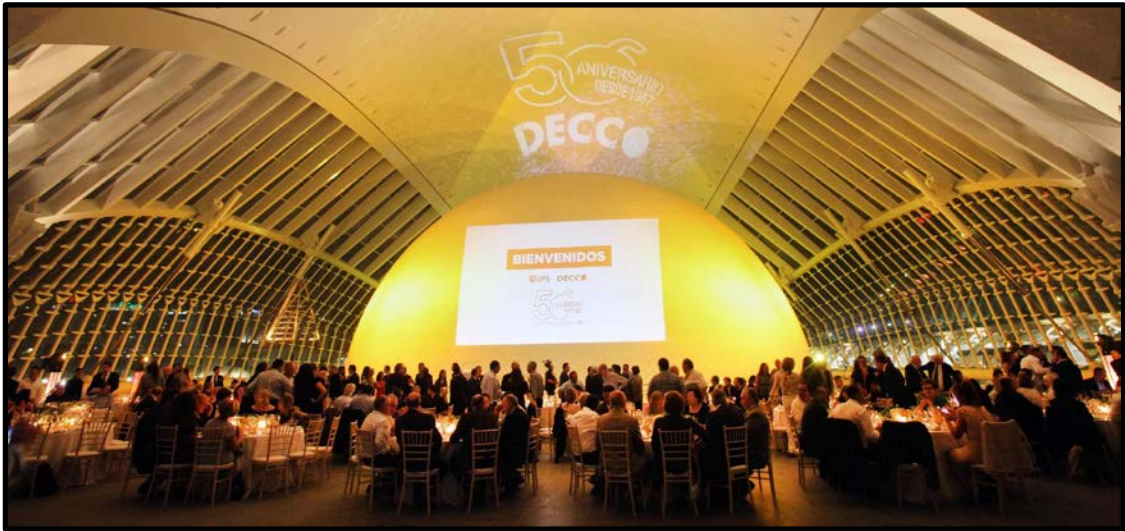
Valencia, September 21, 2017